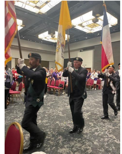
Presentation of Colors